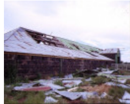
1 deanside woolshed complex rockbank exterior of woolshed