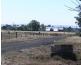
DEANSIDE WOOLSHED COMPLEX SOHE 2008