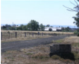
DEANSIDE WOOLSHED COMPLEX SOHE 2008