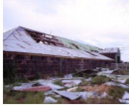
1 deanside woolshed complex rockbank exterior of woolshed