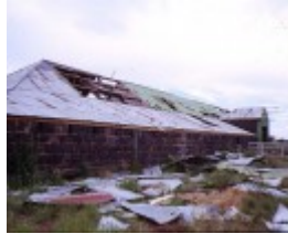
1 deanside woolshed complex rockbank exterior of woolshed