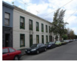
King William St 9-19.JPG