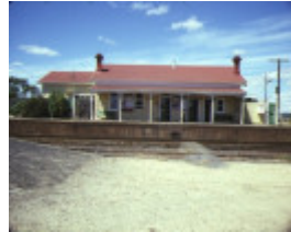
1 rosedale railway station complex willung road rosedale front view feb1985