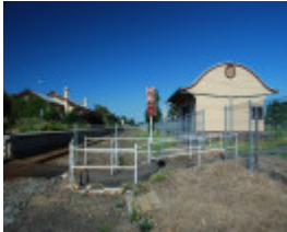
ROSEDALE RAILWAY STATION COMPLEX SOHE 2008