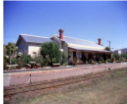
Rosedale Railway Station