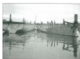
1076 Agnes Agnes&SawmillerWrecks published in Lodding2009