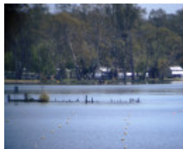
1076 Agnes Agnes SawmillerWrecks 9Nov2009 hls 3