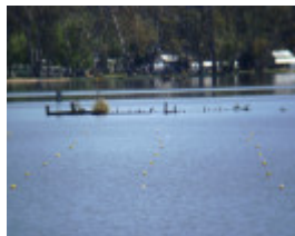
1076 Agnes Agnes SawmillerWrecks 9Nov2009 hls 2