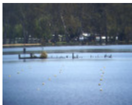
1076 Agnes Agnes SawmillerWrecks 9Nov2009 hls 4