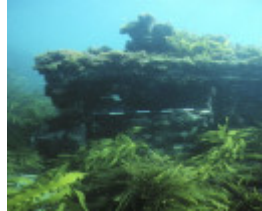
S140 Conside PortPhillipHeadsLonsdale LookingSouth Feb1997