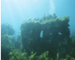
S140 Conside PortPhillipHeadsLonsdale LookingNorth Feb1997