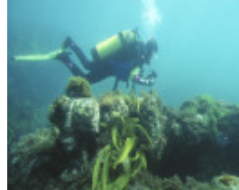
S140 Conside PortPhillipHeadsLonsdale Engine Feb1997