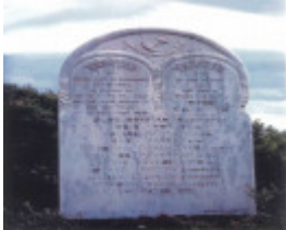
Fiji Headstone at the grave of the 12 people who died as a result of the wreck