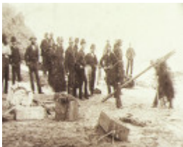
S259 Fiji MoonlightHead CrewOnBeachHistoricPhoto