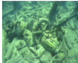
S259 Fiji MoonlightHead SiteView