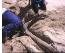
S259 Fiji MoonlightHead AnchorOnBeach