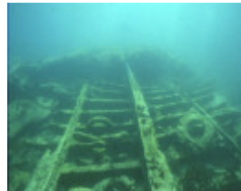
S259 Fiji MoonlightHead HullView MJ