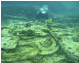
S259 Fiji MoonlightHead Chain MJ