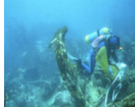
S259 Fiji MoonlightHead AnchorAndDiver