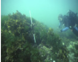
S319 Henrietta PortPhillipBayPointCookReef SideView May1998