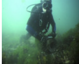
S319 Henrietta PortPhillipBayPointCookReef Diver May1998 JH