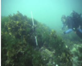
S319 Henrietta PortPhillipBayPointCookReef SideView May1998