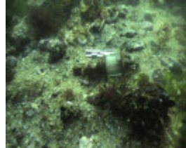
S319 Henrietta PortPhillipBayPointCookReef Artefact May1998 JH