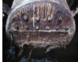
S333 HenryMeakin PortPhillipBayCorioBay Boiler