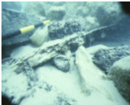
S422 Lydia PortFairy WreckSite