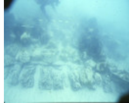
S422 Lydia PortFairy Detail