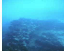
S586 Rotomahana ShipsGraveyardBarwonHeads BowCutwaterSection WC