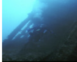
S586 Rotomahana ShipsGraveyardBarwonHeads ForecastleDeck WC