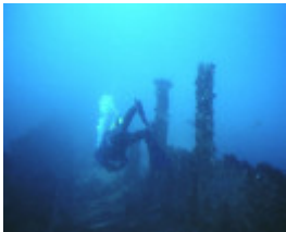
S586 Rotomahana ShipsGraveyardBarwonHeads LowerHull WC