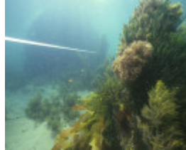
S716 Wauchapoe PortPhillipBay Measuring