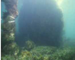
S716 Wauchapoe PortPhillipBay FrontView