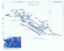
S716 Wauchope SitePlan diveinfosheet 1992