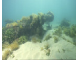
S716 Wauchapoe PortPhillipBay Mast