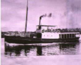
S9 Agnes PortPhillipBayHistoricView dateunknown